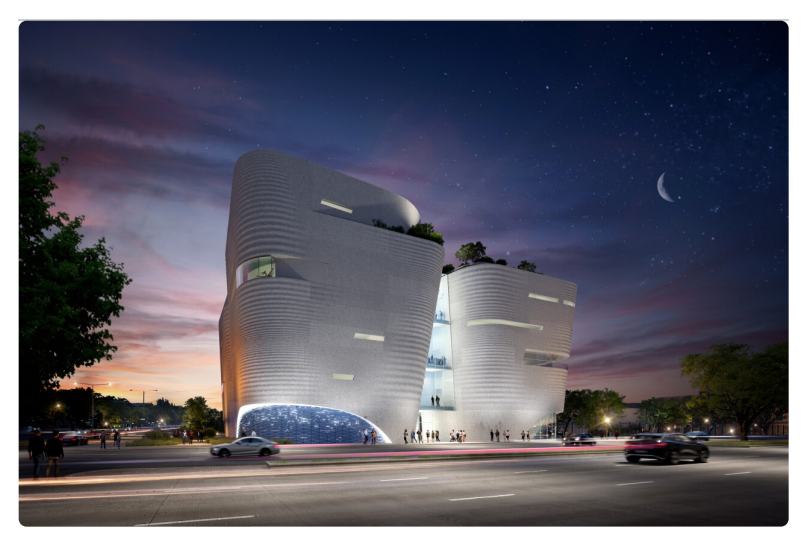
Ennead Architects and Kahler Slater Renderings of the planned Milwaukee Public Museum building.