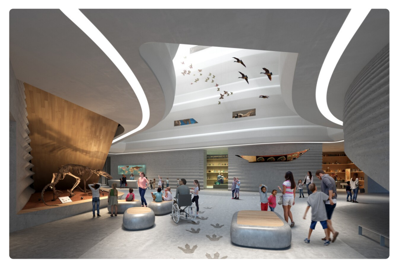
Ennead Architects and Kahler Slater Renderings of the planned Milwaukee Public Museum building.