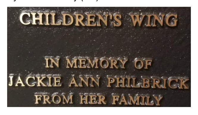
North Shore Library (Glendale, WI) - Future